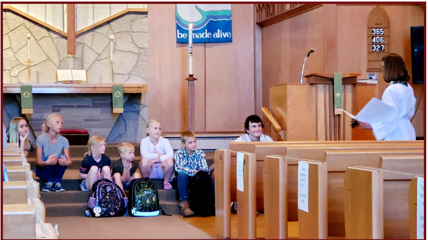
The Backpack Blessing at Belfield Lutheran Church on Sunday, September 23rd