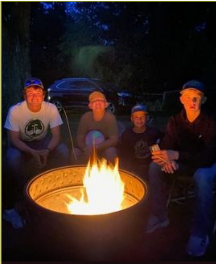
Smore time during the Youth Weekend Gathering